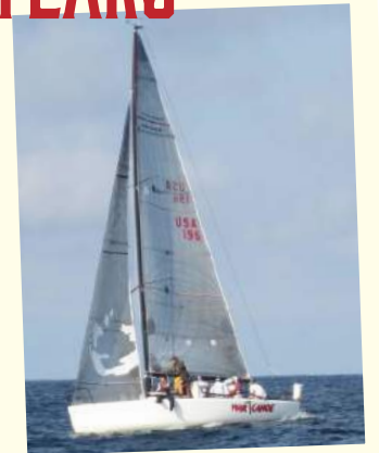
WAR CANOE – 1st in Fleet 2011, 2023; 1st to Finish 2009, 2011, 2016-17, 2023; Record for lowest elapsed time for Monohull Fleet 2018