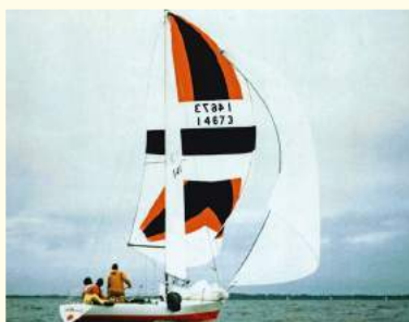
HALLOWEENY – 1st in Fleet 1977