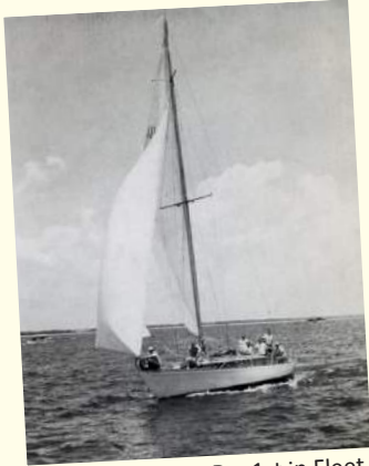
WHISPERING WIND – 1st in Fleet 1958, 1959; 1st to Finish – 1960-61, 1963, 1965