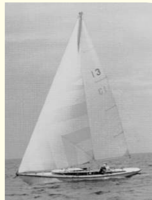
CHULA – 1st in Fleet 1950, 1952, 1964