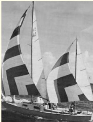
ROULETTE – 1st in Fleet – 1960, 1963