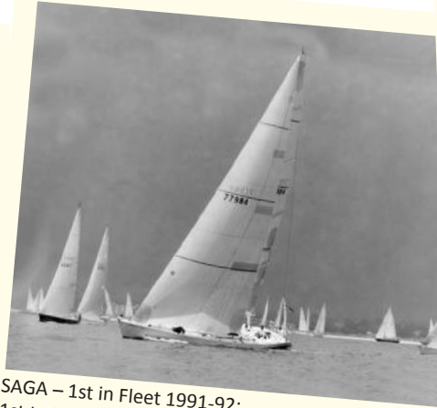
SAGA – 1st in Fleet 1991-92; 1st to Finish 1987-95, 1997