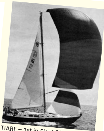
TIARE – 1st in Fleet 2003-04, 2006-07, 2014; 1st to Finish 1967, 1969-70