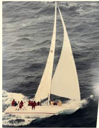
GAUNTLET – 1st in Fleet 1983-86, 1st to Finish 1983-86