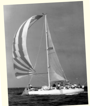
HEARTBEAT – 1st in Fleet, 1st to Finish 1998