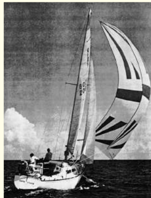
SOUTH TYGER – 1st in Fleet – 1980