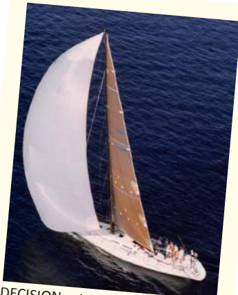
DECISION – 1st in Fleet 2005; 1st to Finish 2001-05