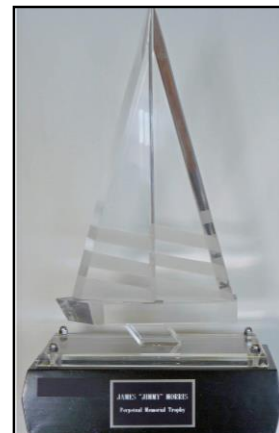
Jimmie Morris Perpetual - PHRF B

Entries are through Regatta Management Systems as linked on the KHYC Race Schedule.