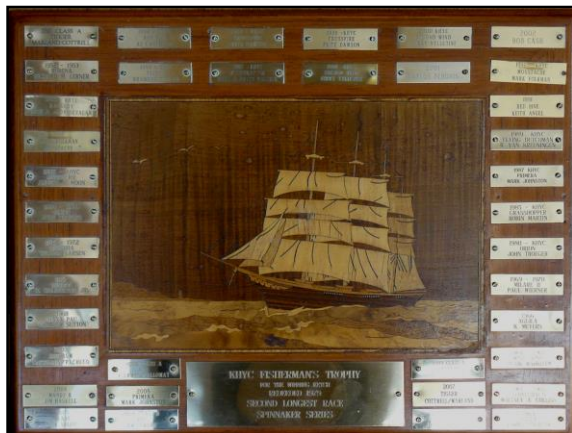
Fisherman's Perpetual Trophy - PHRF A